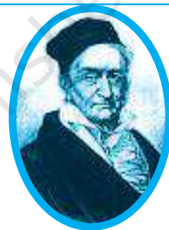
Carl Friedrich Gauss (1777 – 1855)

Carl Friedrich Gauss is often referred to as the 'Prince of Mathematicians' and is considered one of the three greatest mathematicians of all time, along with Archimedes and Newton. He has made fundamental contributions to both mathematics and science.